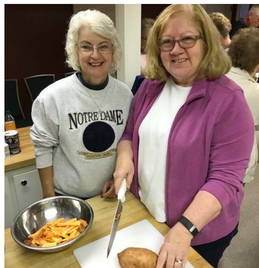
Dining with Diabetes-Canadian Lakes, Mecosta Co.

Chronic diseases—such as diabetes—can be difficult to manage. To help residents be healthy at every stage of life, Michigan State University Extension delivers affordable, relevant, evidence-based education to serve the needs of adults, youth and families in urban and rural communities. Classes include Preventing & Managing Chronic Illness, Preventing & Managing Diabetes, Diabetes Food Skills, Fall Prevention, Tai Chi for Arthritis, and Caregiver Support.