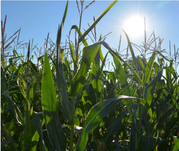
Field crops and forages are large agricultural crops in Mecosta County.