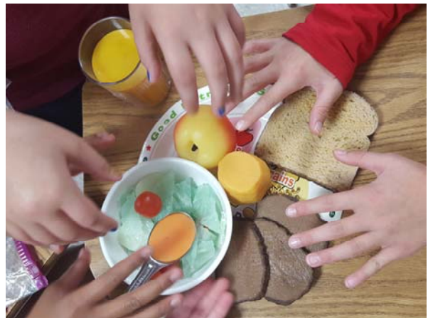
Local Students Participating in a Nutrition Education Program.

MSU Extension’s Supplemental Nutrition Assistance Program provides basic nutrition education and hands-on activities for all ages. Core curricula are designed to help low-income families stretch their food dollars while maintaining good nutrition. Some instruction includes physical activity and cooking techniques that help instill life-long skills. It is estimated that every $1 spent on nutrition education saves as much as ten times the amount in long-term health costs.