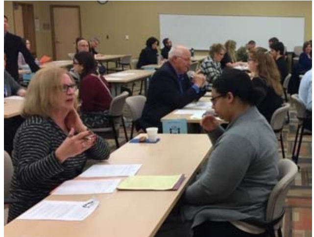
During a Mock Interview Day, youth pair up with adult volunteers and practice their interview skills.

“Mock Interview Day” offers students the opportunity to practice interview skills and network with the business community. Students are expected to bring a completed resume, job application or portfolio, and dress appropriately for an interview. Students receive individual feedback from volunteers. They become more prepared for job-seeking as a result of this experience. This program was started at Crossroads Charter Academy and served 149 Mecosta County youth.