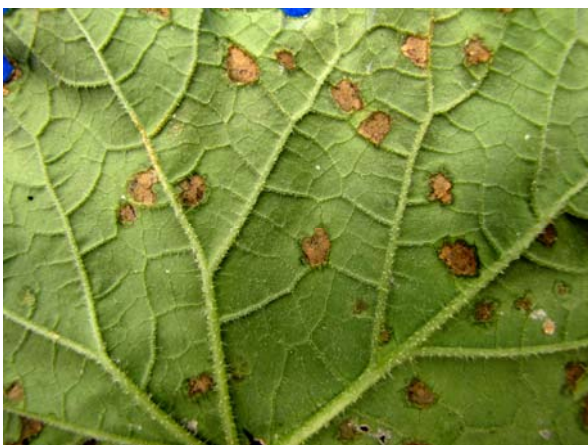
One of the many plant disease samples brought into the Extension office for identification.