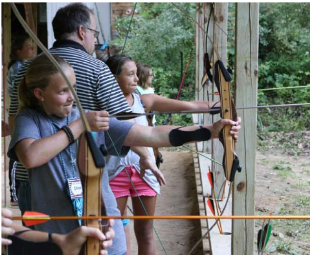
4-H youth learning archery skills at 4-H camp.